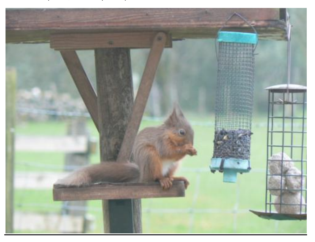
Gary's opinion is that it is a juvenile from the back end (August) of 2020

18<sup>th</sup> April - We had the tiniest squirrel at the bird table today it was here ages, no adult in sight. The small squirrel ate and ate and ate. It has huge ear tufts for a baby squirrel but we think it must be this year's, what is your opinion? Best wishes Joan