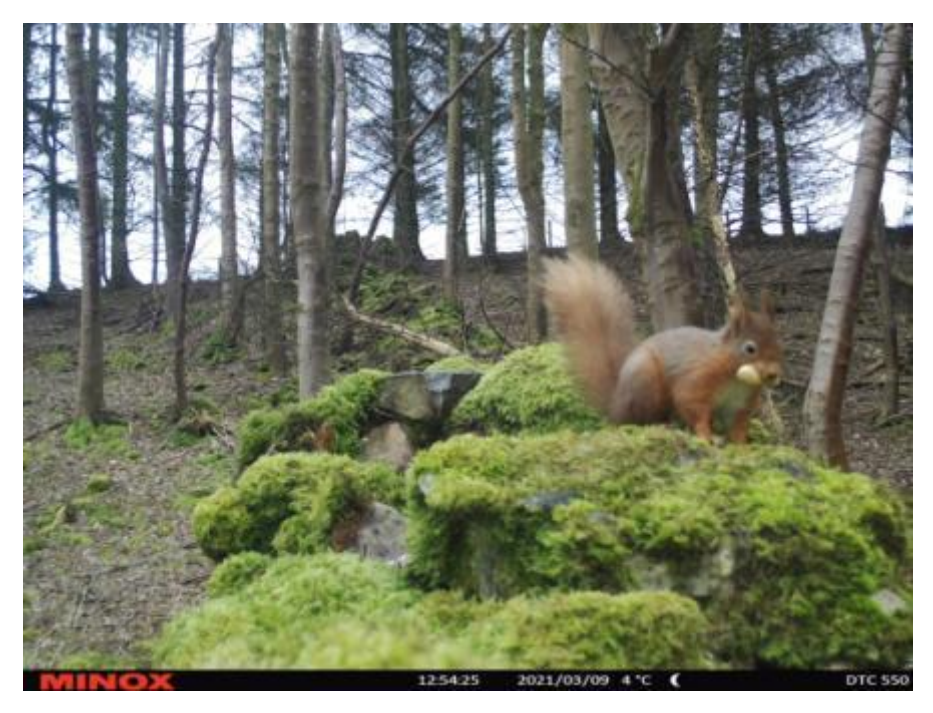
Still not quite what I'm after

By the 11<sup>th</sup> the visits were now quite early, just before 0700 hrs and whilst not as prolific as down at Longhill Wood, were still for a hour or so at a time.