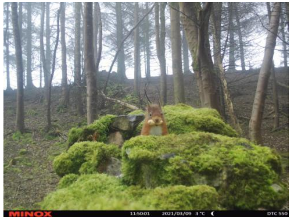
I'm fairly happy with this one!

After a few days I moved it further back along the wall and this seemed to get better results.