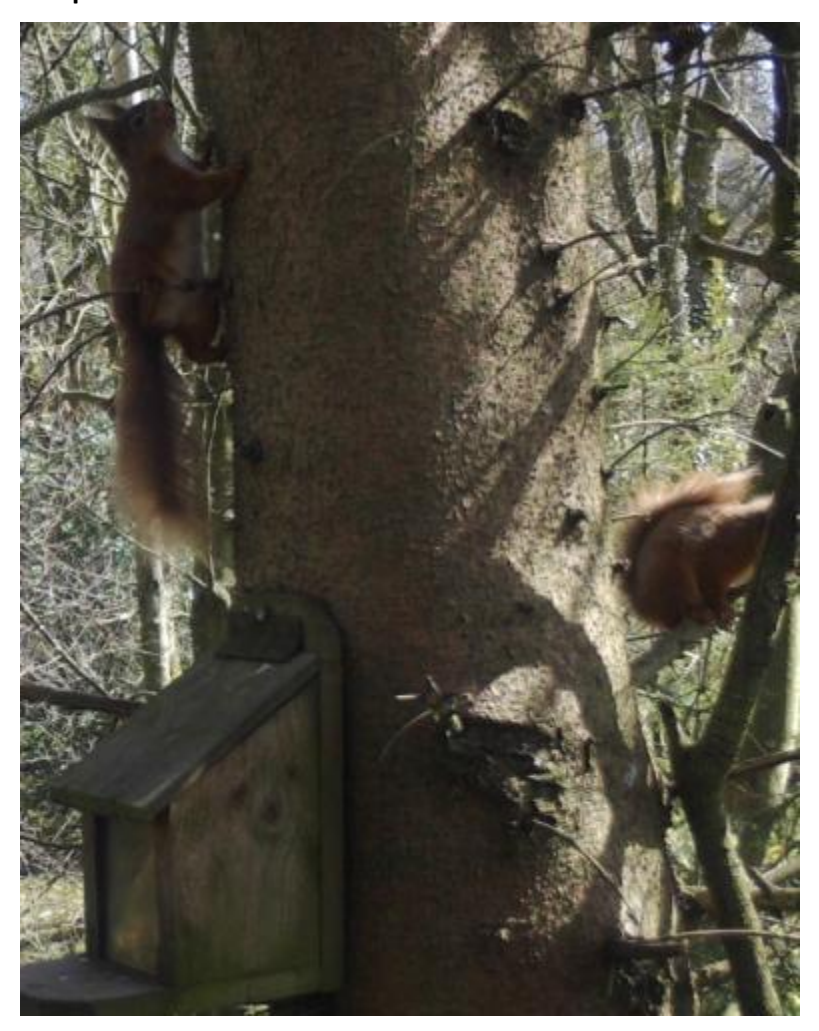
Always warming to see more than one red at the same time The amount of feed taken over the last few days has actually decreased.