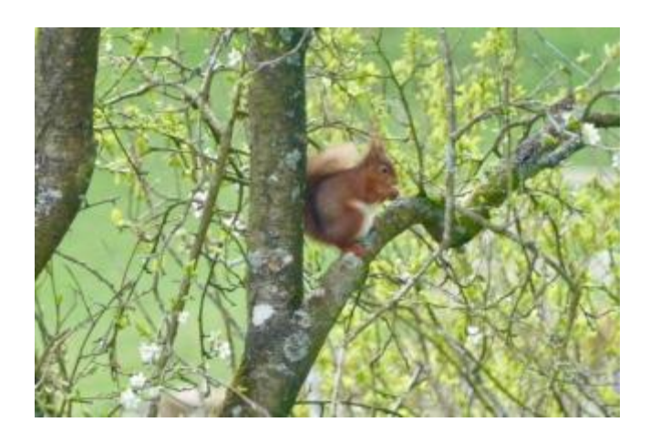
26<sup>th</sup> – 1800 Hrs - Just spotted this little fellow in the garden Darren.