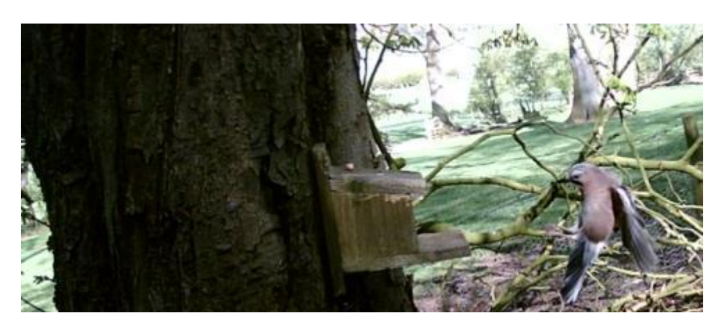
Jay in flight