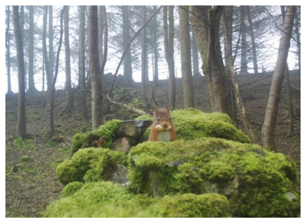
Ewe Close Wood, Maulds Meaburn