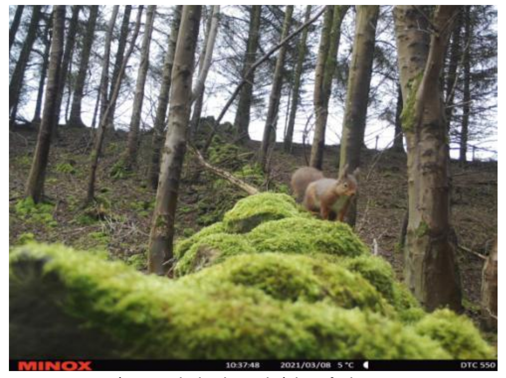
It's not too bad a photo – let's hope for better

But the after I moved the camera further back along the wall I seemed to get better results as seen in the section above.