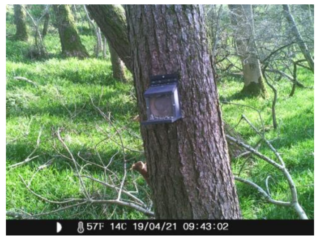
No room for two

In many ways this wood remains a success, greys driven out last year and only reds being seen.