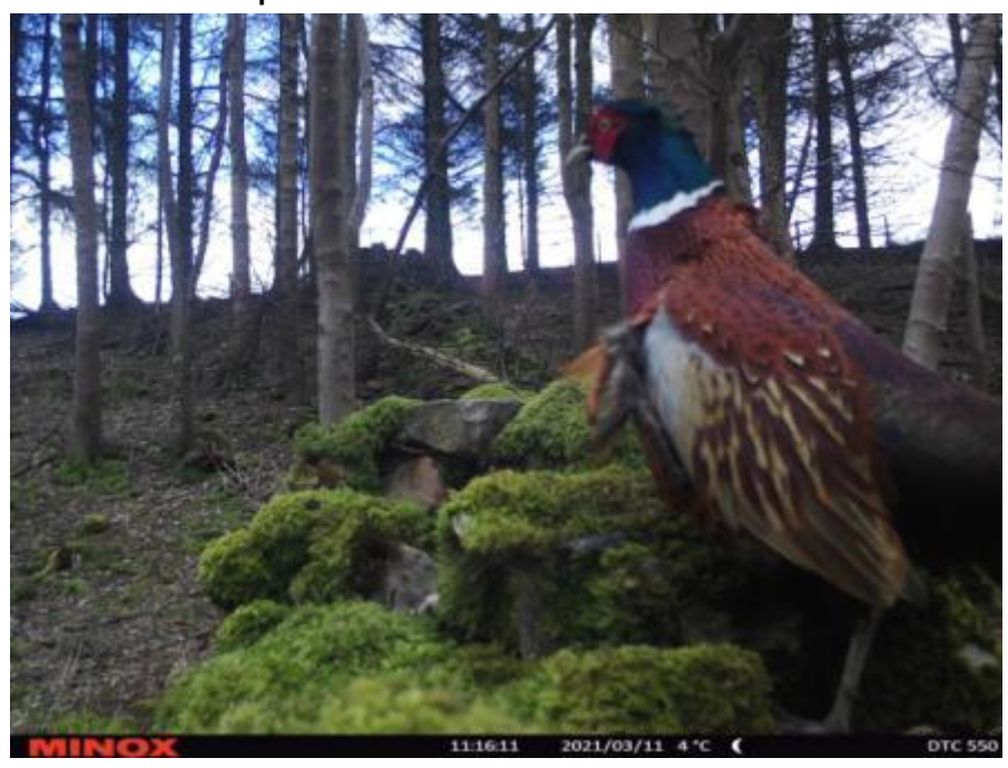
This next one could have been perfect ... but wasn't