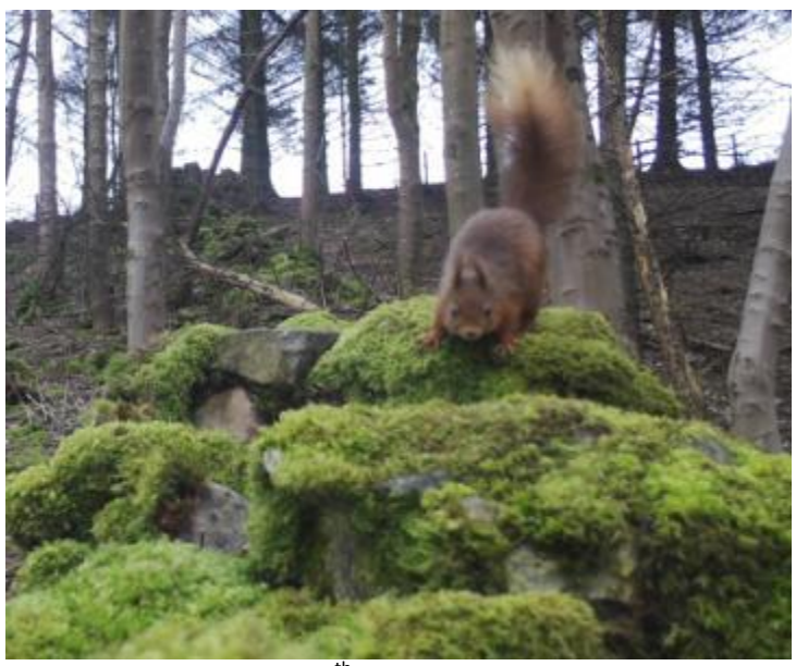
I gave it till the 18<sup>th</sup> when I moved the camera

By the 11<sup>th</sup> the visits were now quite early, just before 0700 hrs and whilst not as prolific as down at Longhill Wood, were still for a hour or so at a time.