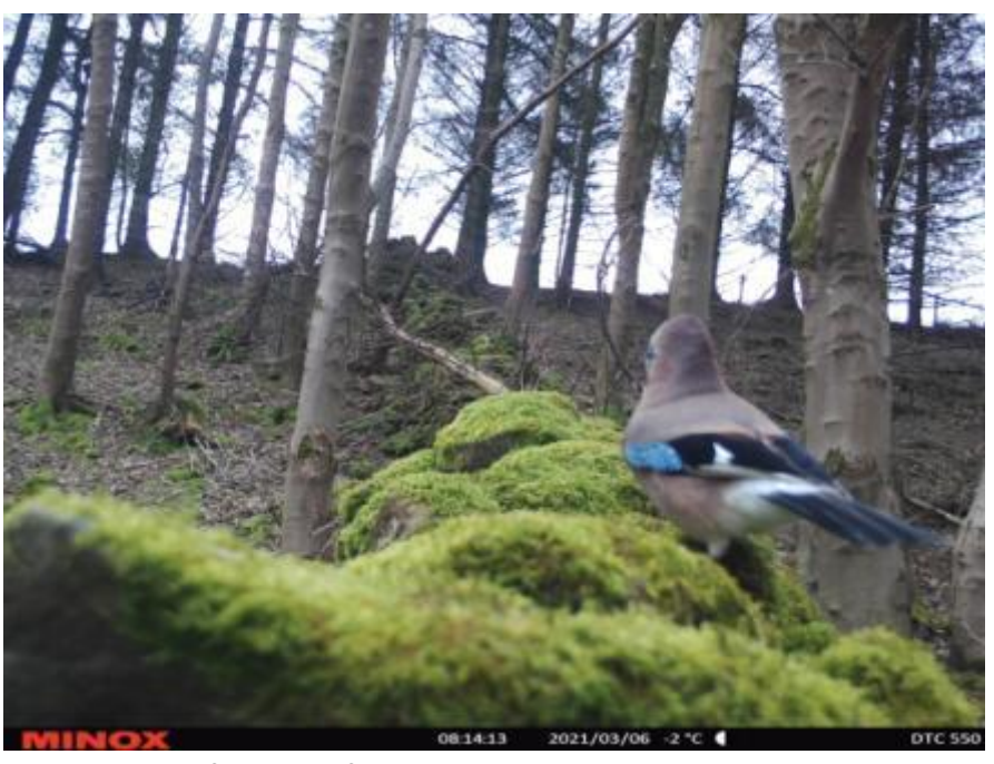
Plenty of photos of birds and especially the nuisance Jays