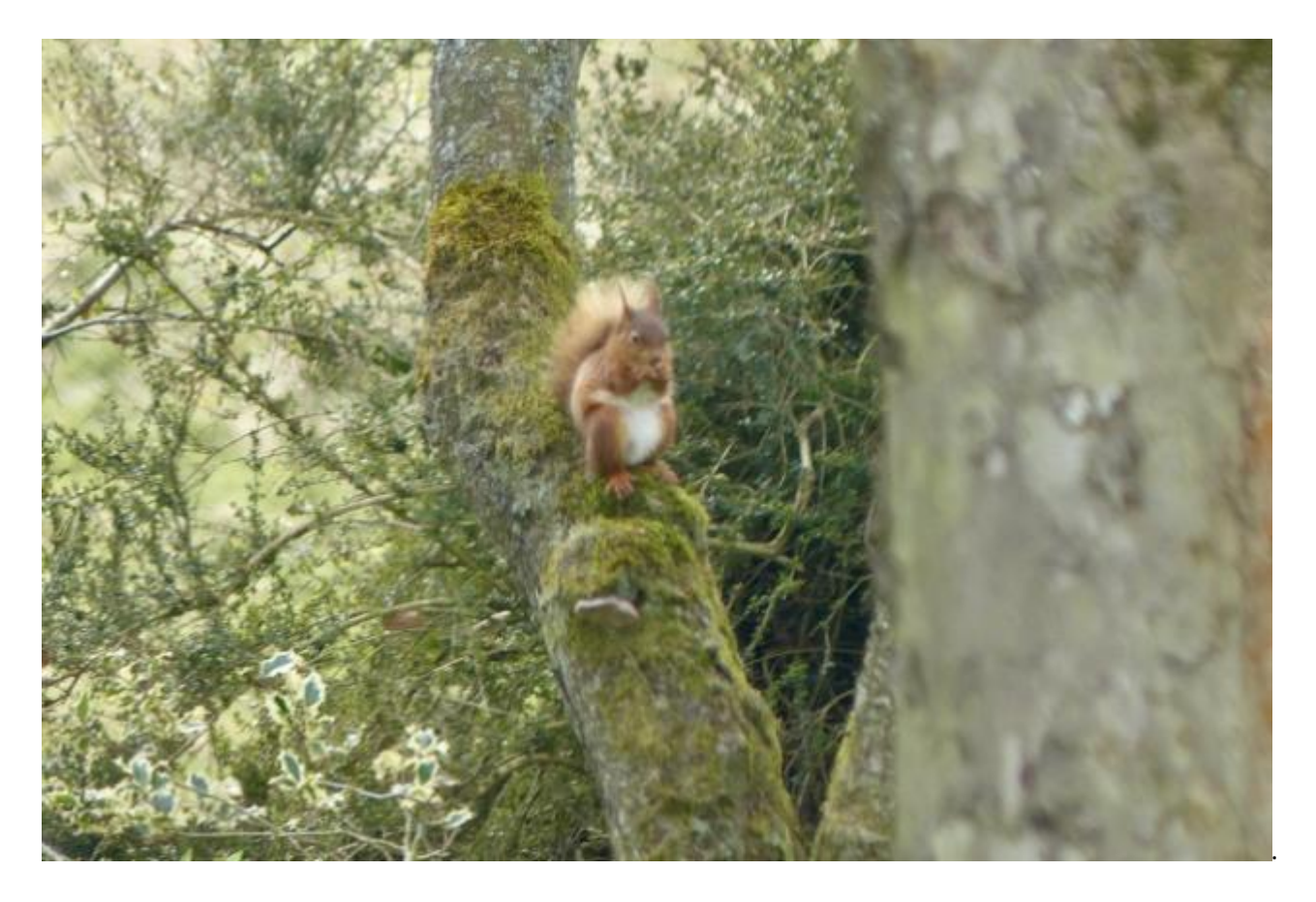
21<sup>st</sup> - Just briefly, we saw this little red dancing around our garden and trees and digging for nuts - He/she looks very healthy - Pennie