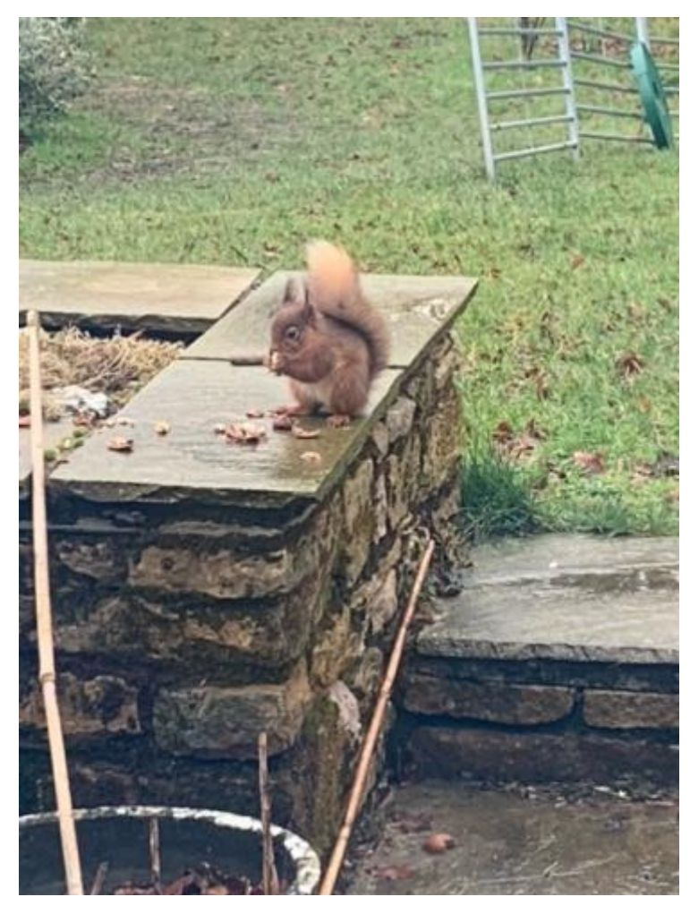
Dunkirk – an entry to the 'red with food in its mouth other than a monkey nut' Competition.