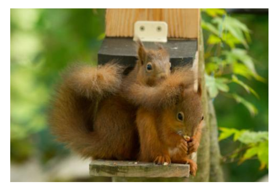
Well Head, Crosby Ravensworth

Below is a chronology of sightings of greys over these last two months: