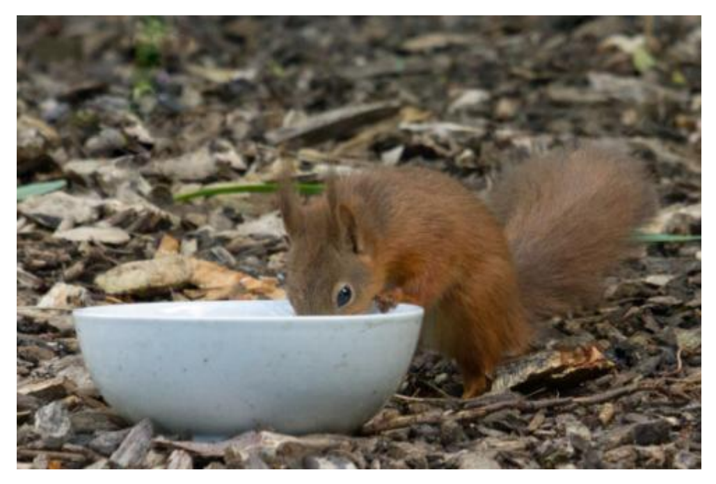
Well Head, Crosby Ravensworth