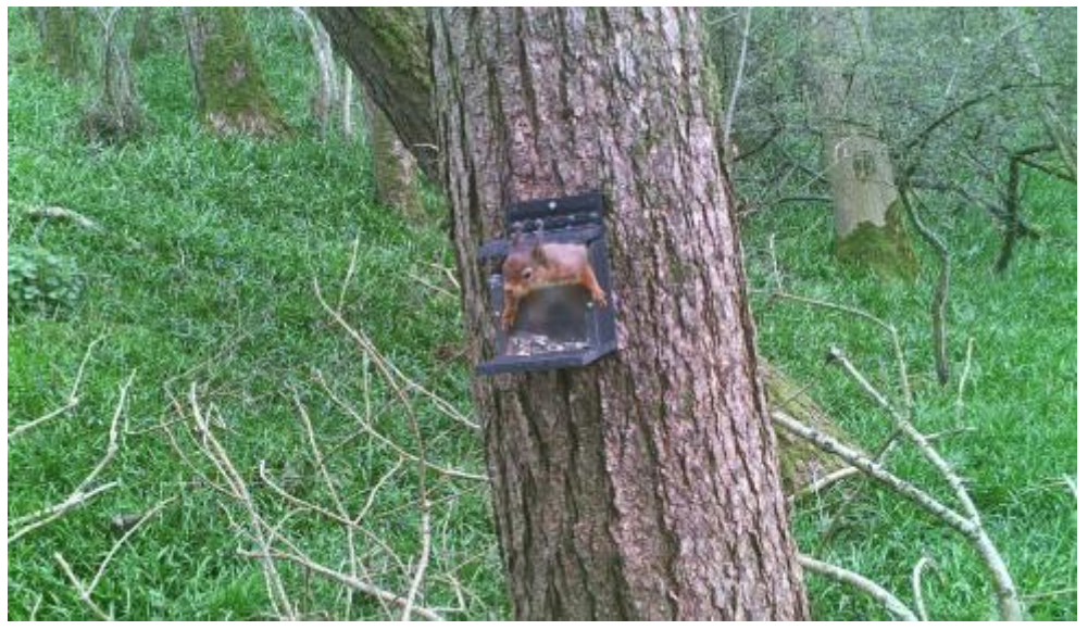
Longhill Wood, Maulds Meaburn