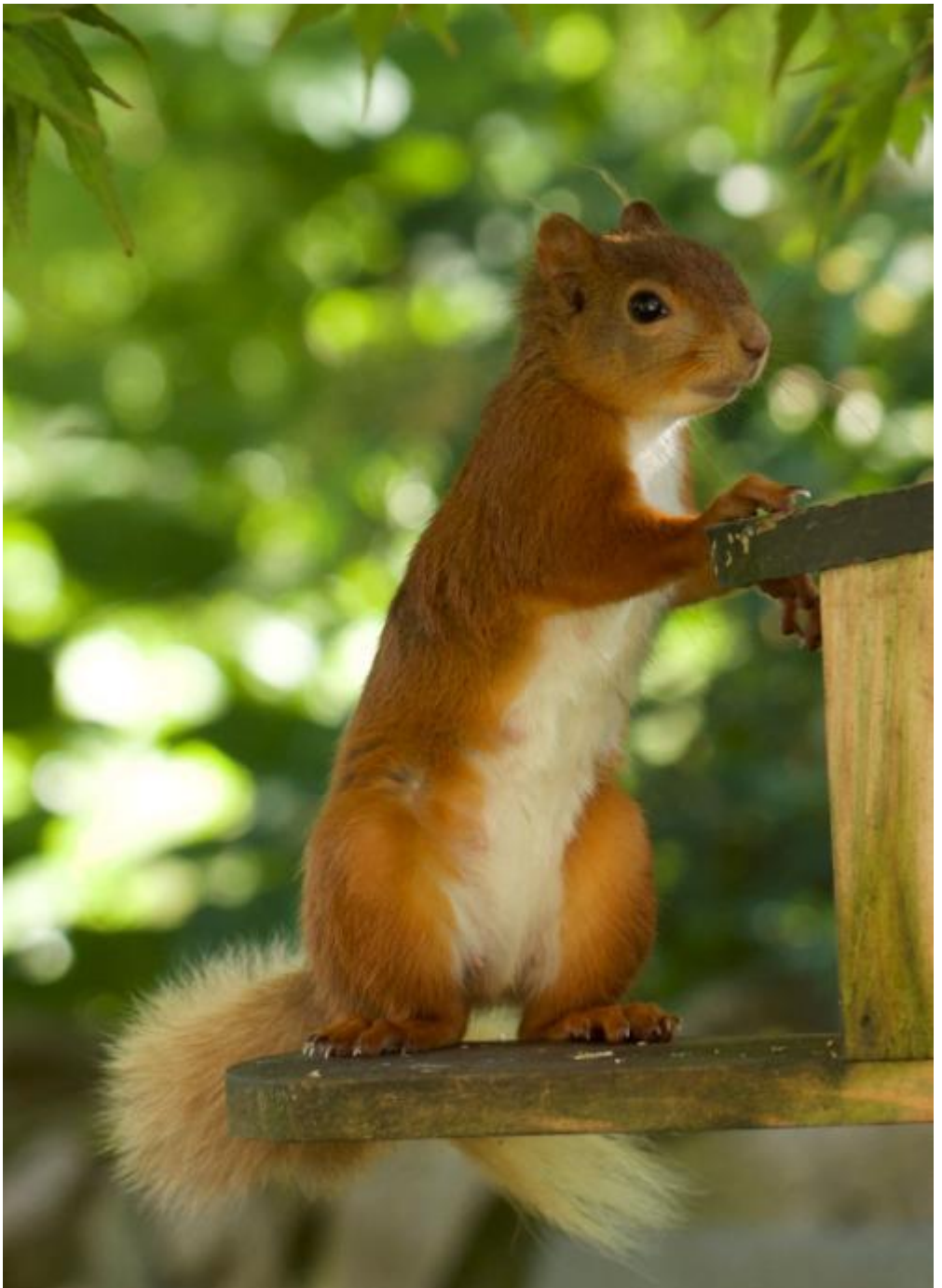
Well Head, Crosby Ravensworth