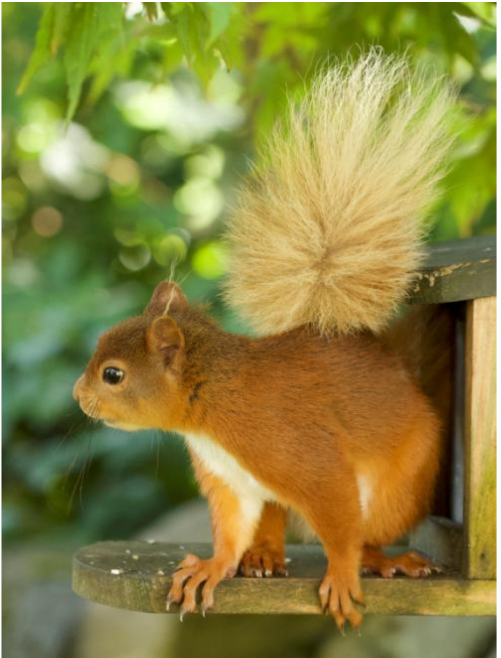
Well Head, Crosby Ravensworth