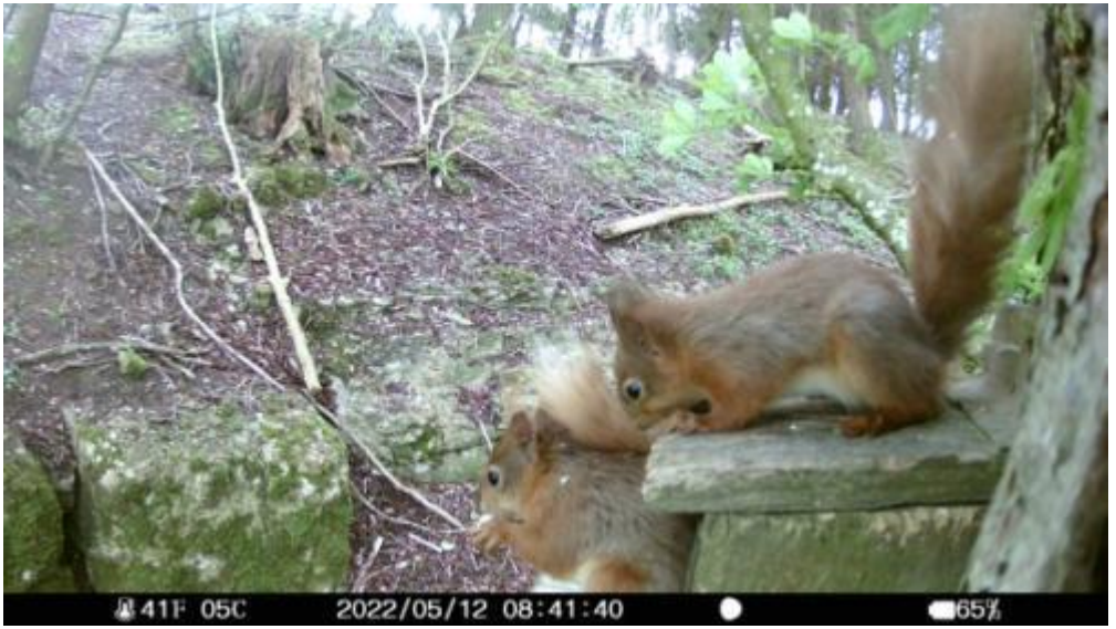
Three Cornered Wood, Maulds Meaburn