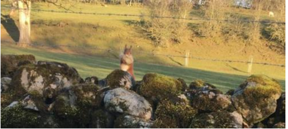
Nest Making (towards Oddendale)

Unfortunately over the summer I don't get too much time to get down to Crosby Ravensworth to check the feeders along the river as I tend to be in the woods around Maulds Meaburn, but the reds seem to have returned in abundance to the village.