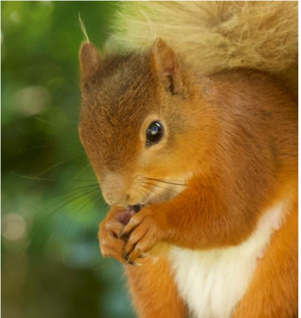
Well Head, Crosby Ravensworth