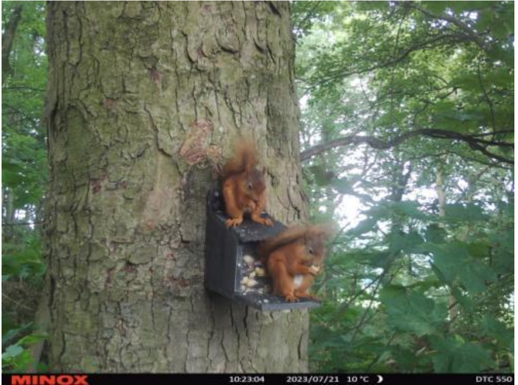
Longhill Wood

At the beginning of the period things were OKish.