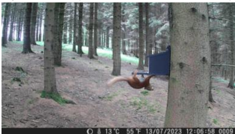
The date should read the 12 th on both

12 th – a red and a GREY – the new camera is taking very few photos, have adjusted the settings to see if that helps – I've also realised that the date is a day ahead!