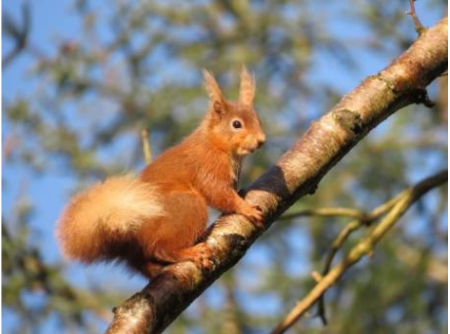
Prickly Bank Wood

There are other feeders in resident's gardens