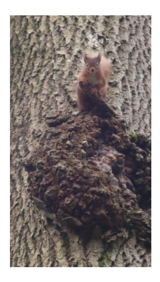
Lyndene - Red on our feeder on riverbank every day. It always feeds upside down! Likes to eat from the bird feeder rather than its own. I'll have to have a word with it! Keith Golding