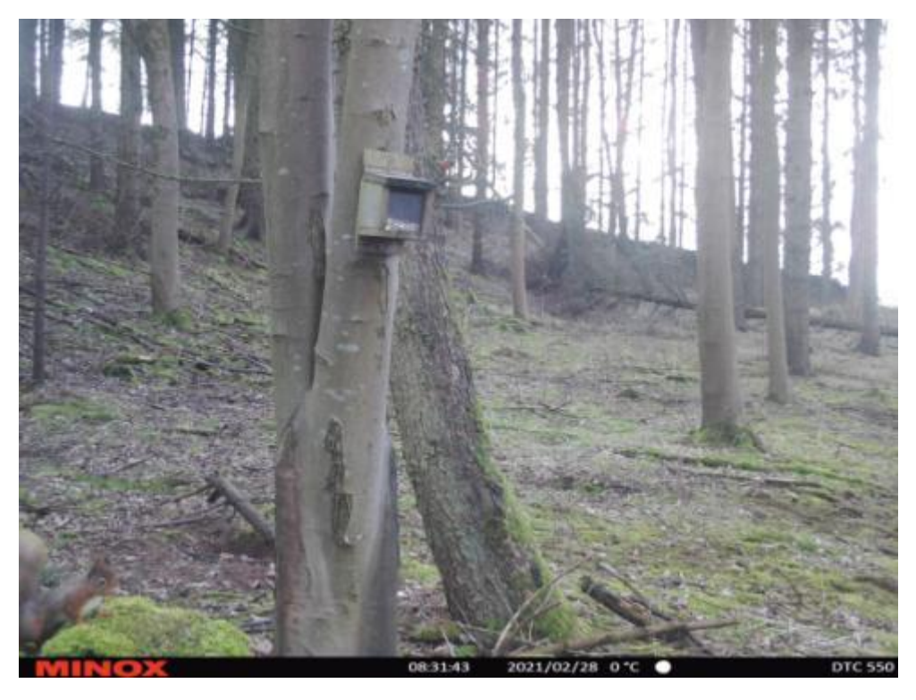
I have put a camera on the wall to try and get that real close up cute photo as they approach the feeder – will it work?

End of Feb – still visited daily by a red(s) with the feed being taken