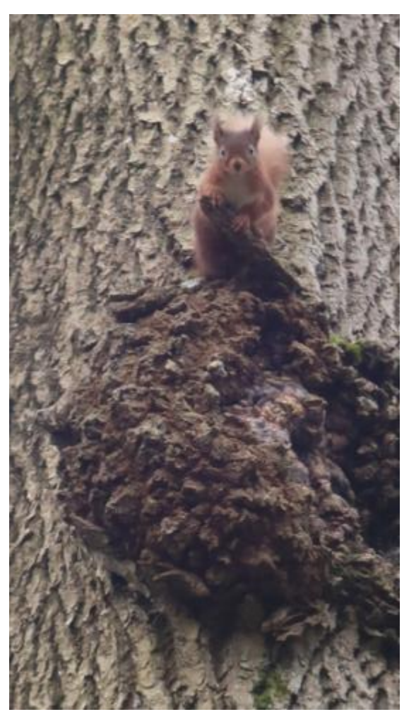
Bank Head, Crosby Ravensworth