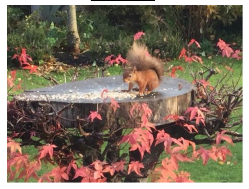
Thwaites Cottages, Maulds Meaburn