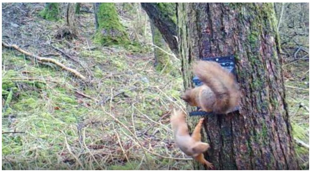
17<sup>th</sup> – still x2 REDS – visits becoming longer – 1 hour a time x2 this morning.