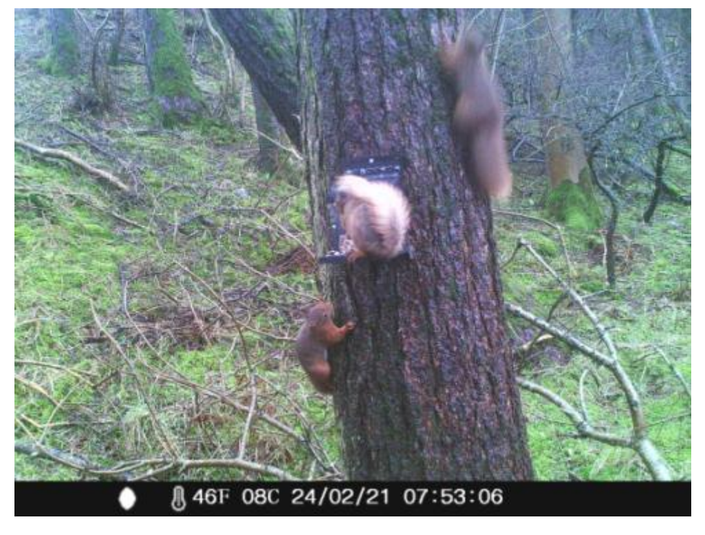
It isn't the best of photos (a little blurry), but it's good enough for me!

End of Feb – still visited daily by reds with all the feed being taken.