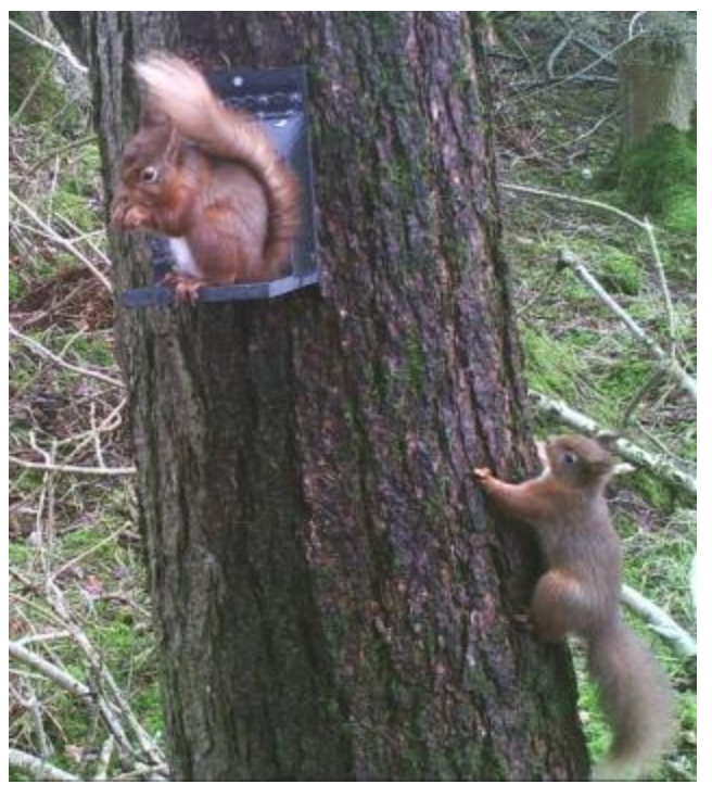
18<sup>th</sup> – this pair of reds do arrive early (0742 hrs – just after sunrise) and today they stayed until 1236 hrs!