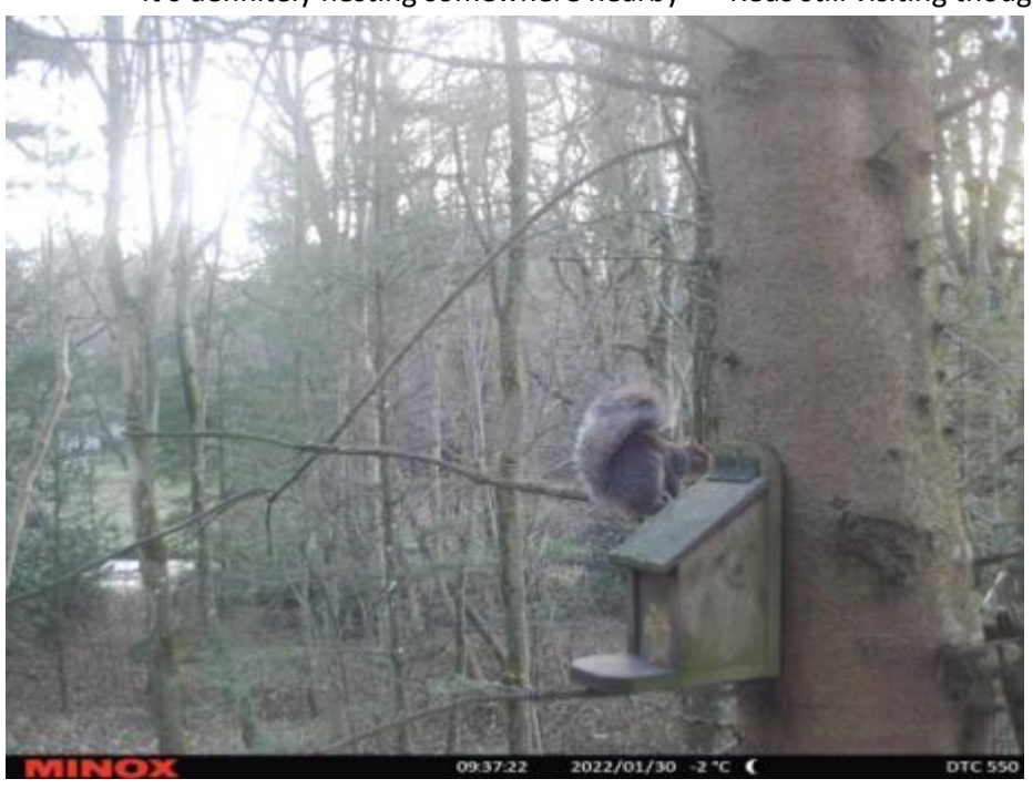
Whilst at the 'Pump House Feeder' the grey hasn't visited, just reds (x2)