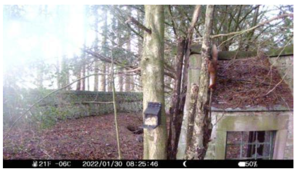
And always approaches from above.