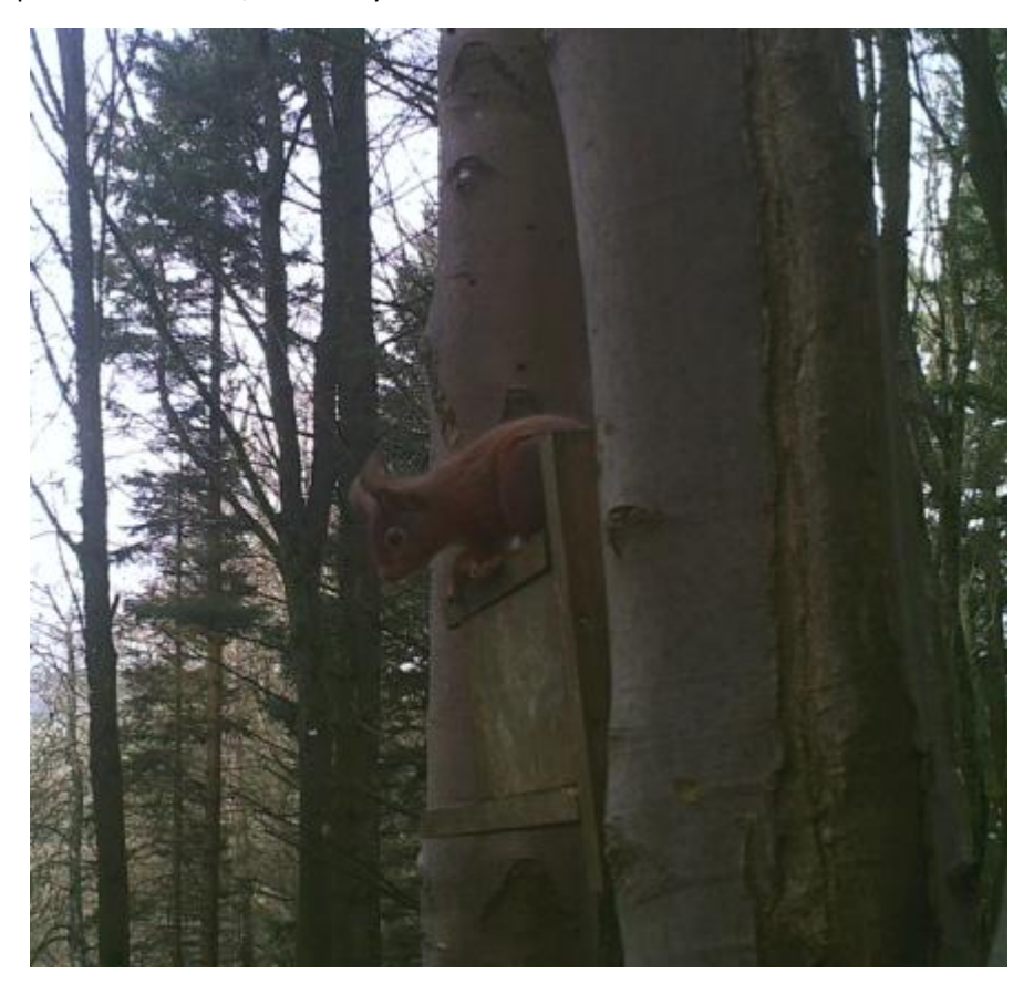
27<sup>th</sup> – only reds so far – moved the camera to a different tree

26 <sup>th</sup> – I tried a new camera angle, but it's not overly worked as there were only a few photos. However, have only seen a red.