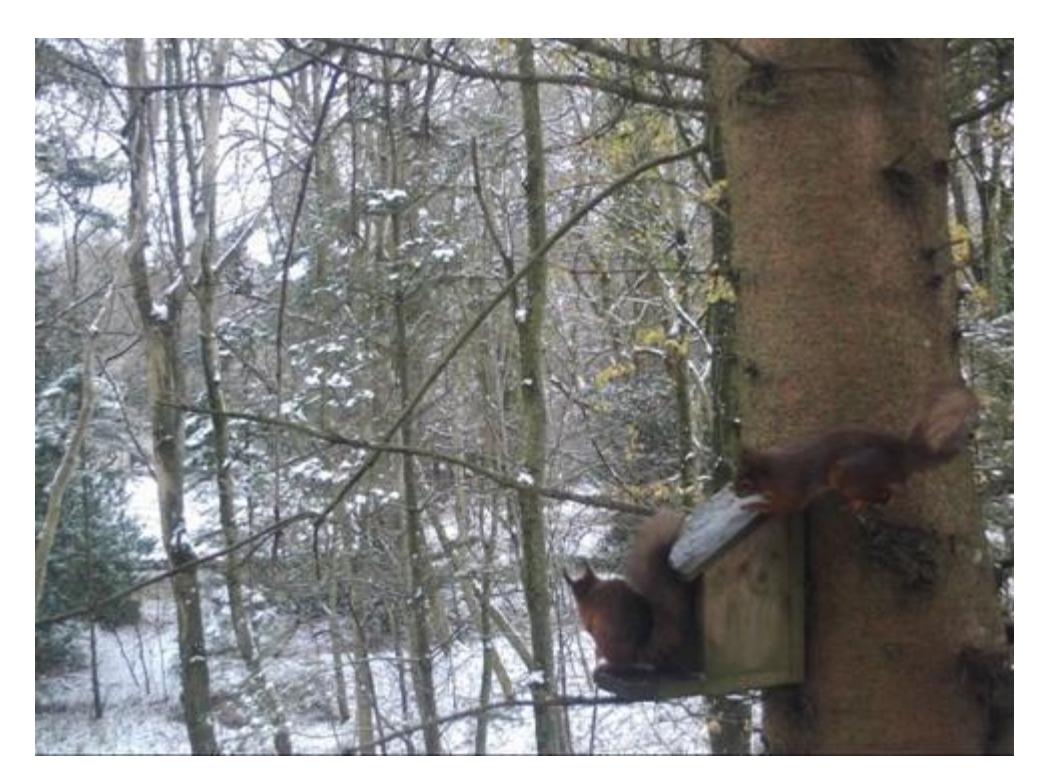
A snowy scene in Flass Wood