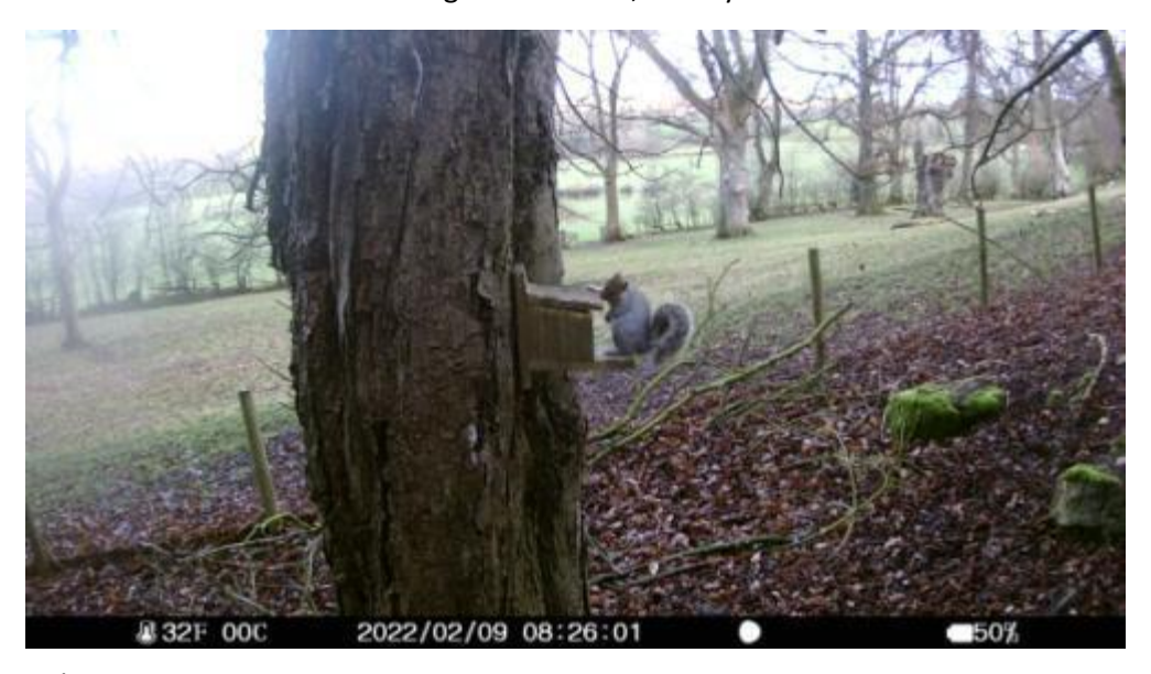
There 08-1000h and then again 15-1515h, shortly after I arrived

11<sup>th</sup> – after work I attended for about 20 mins (1610-1630h) and saw nothing