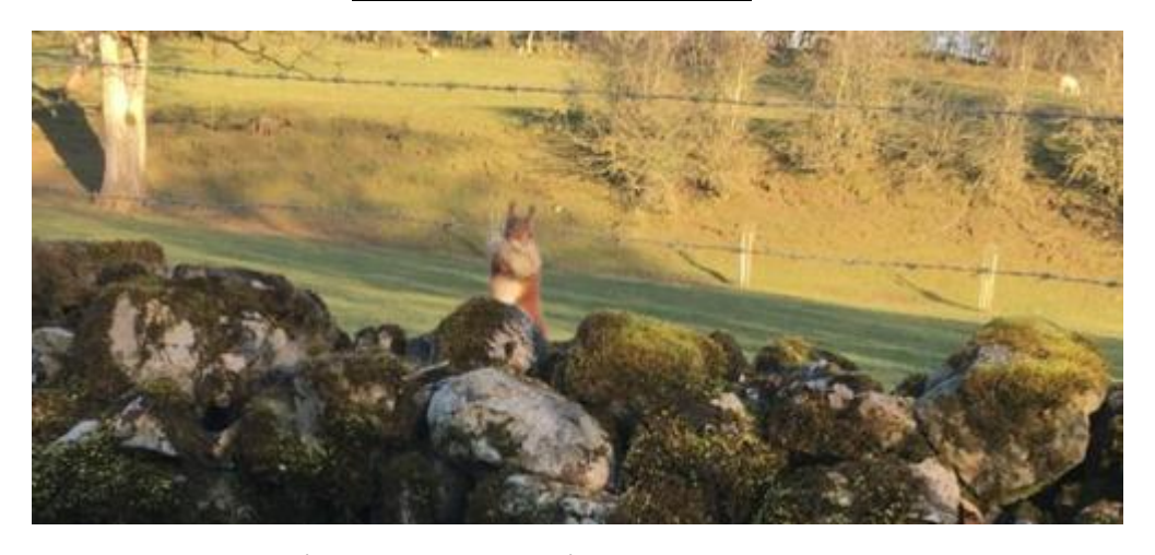
Nest Making (towards Oddendale)