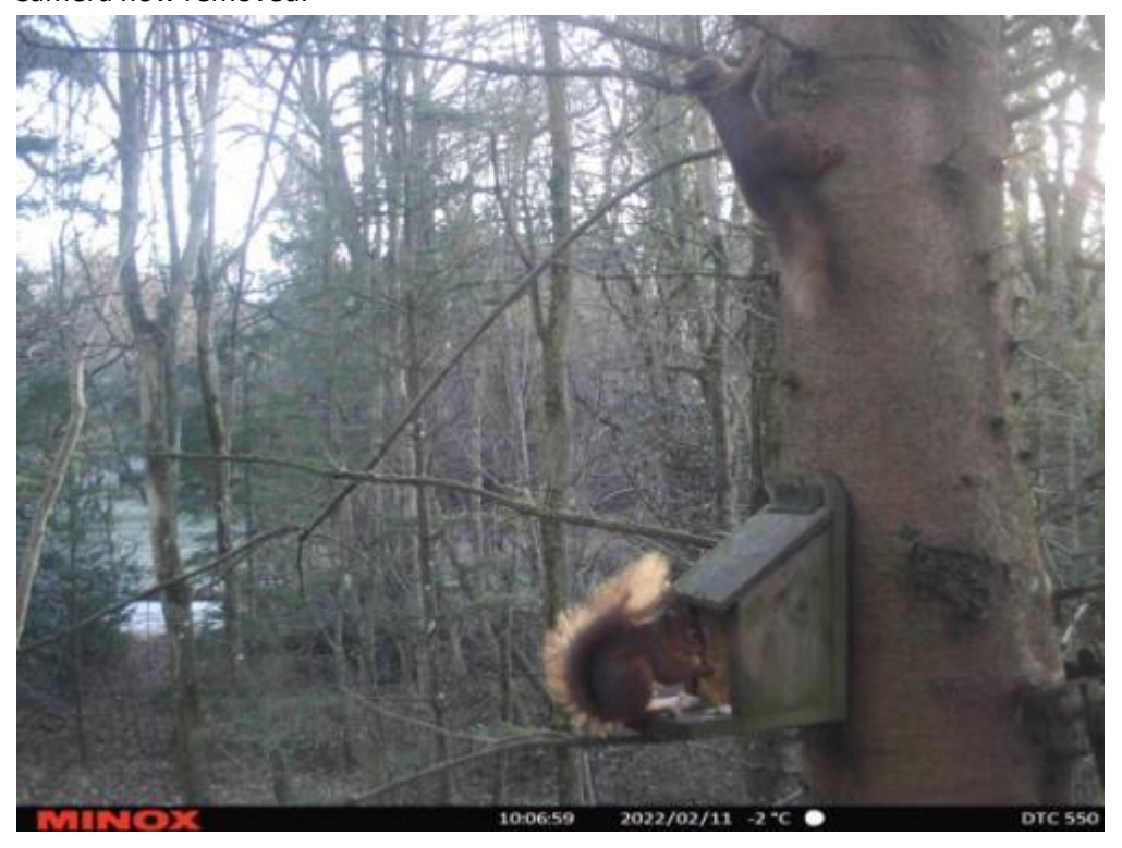
15 <sup>th</sup> – at 0735h as I was walking through, took a quick look and a red was just making its way to the Pump House Feeder – topped up late afternoon.