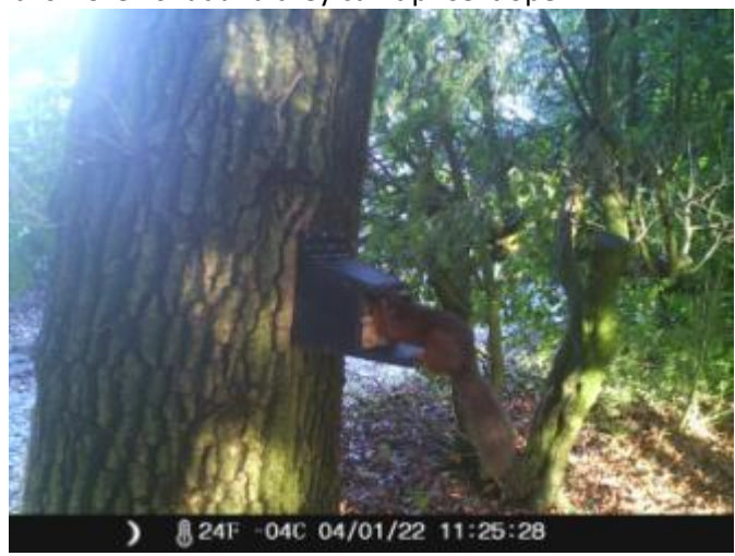
5<sup>th</sup> – feeders empty – has either become unfrozen or the 'new red' has worked out how to get in!

8<sup>th</sup> – hasn't been a grey for ages then one turned up today from 1043-1103h