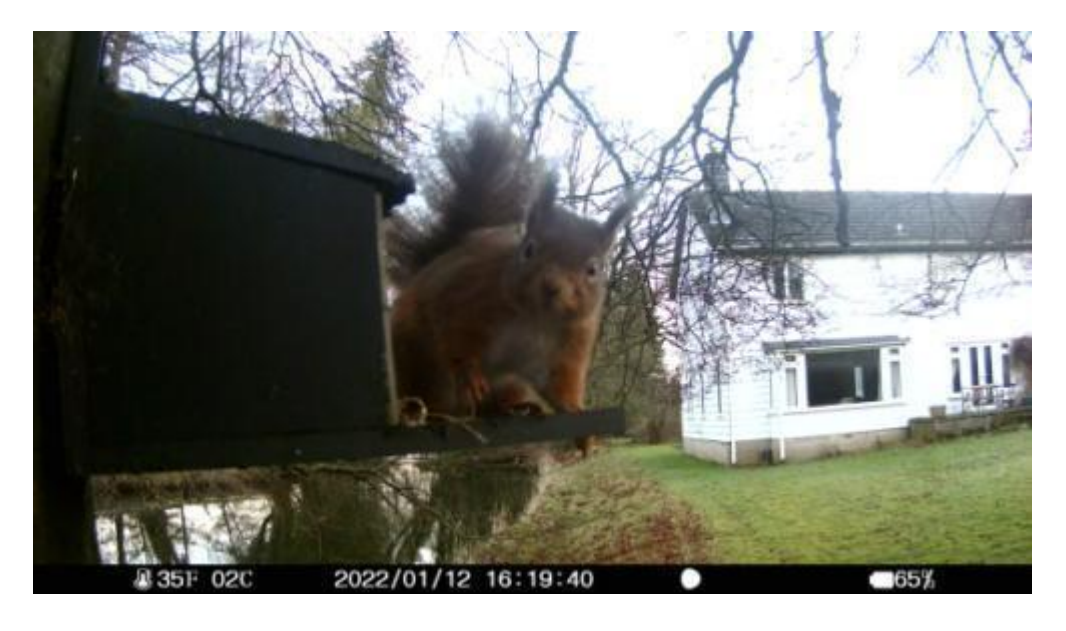
1^{st} Feb – 0845h and 30 mins after I had topped the feeder up, a red.

7<sup>th</sup> Feb – it must have been close to 2weeks since I've had to top up the feeder that looks out over the green, today it was empty. Red on the garden feeder this afternoon