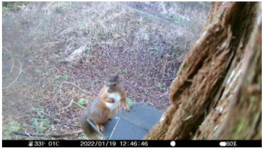
Pause for thought!

On checking the camera on the 21^{st} , the grey is back! Just briefly (only x2 photos at 1242 and 1324 Hrs) and worse still, onto another feeder, the one in the garden