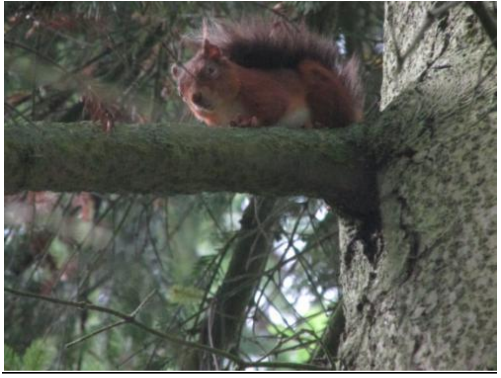
Flass Wood, Maulds Meaburn