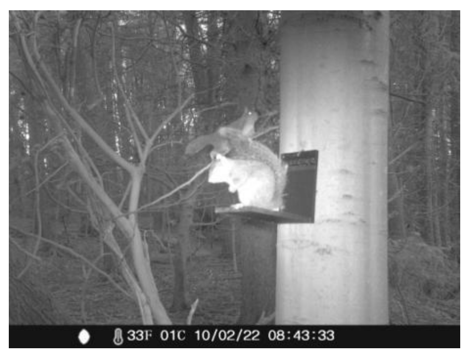
13<sup>th</sup> – have been defeated by the weather yesterday and today

**Fleeting visits from a RED but the food has gone by that time**