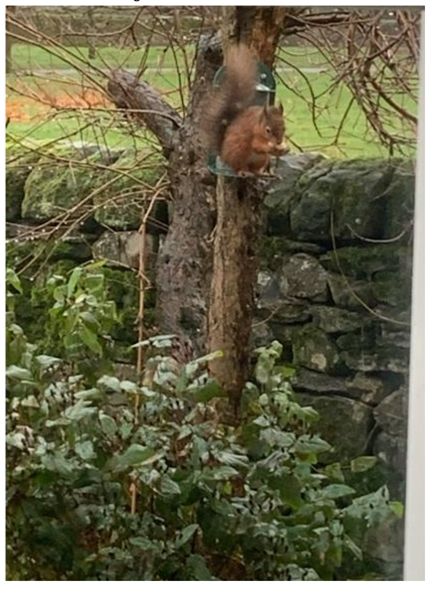
\mathbf{4}^{\text{th}}\,\mathbf{Dec}\,\mathbf{-}\,\mathrm{visitor} this morning at Thwaites