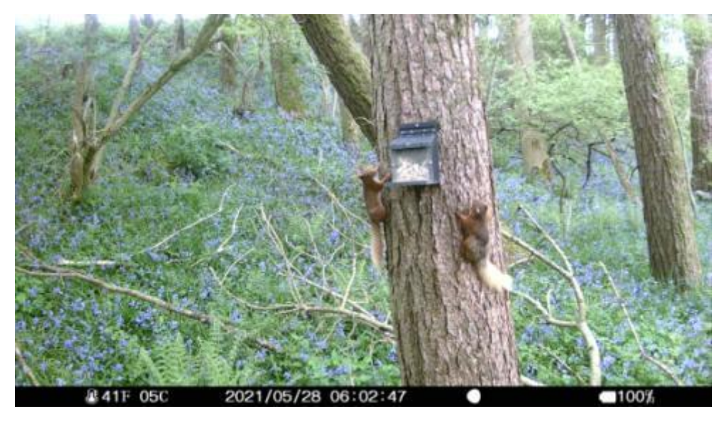
18<sup>th</sup> June – had still been reds all the way ... until this morning!