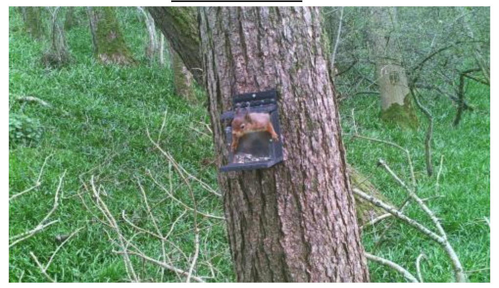
Longhill Wood, Maulds Meaburn