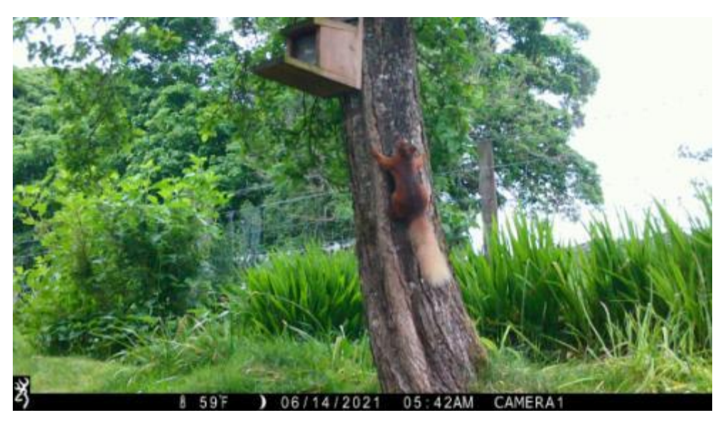
19 <sup>th</sup> June - Some good news: We now have an adult with one young red squirrel feeding daily in our garden at Well Head.

ED: - Now check the photo below, the squirrel and the bowl – below is Andrew's reply re my enquiry as to whether it is a young red