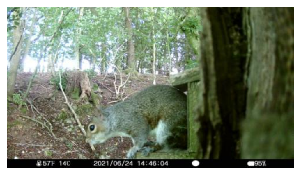
24 <sup>th</sup> June – grey back at 0748 hrs and has several prolonged visits up to the point that I arrive, 1545 hrs when it is still on the feeder.

No red at all today (up to my arrival) – but did arrive at 1631 and spent just over a hour on the feeder.