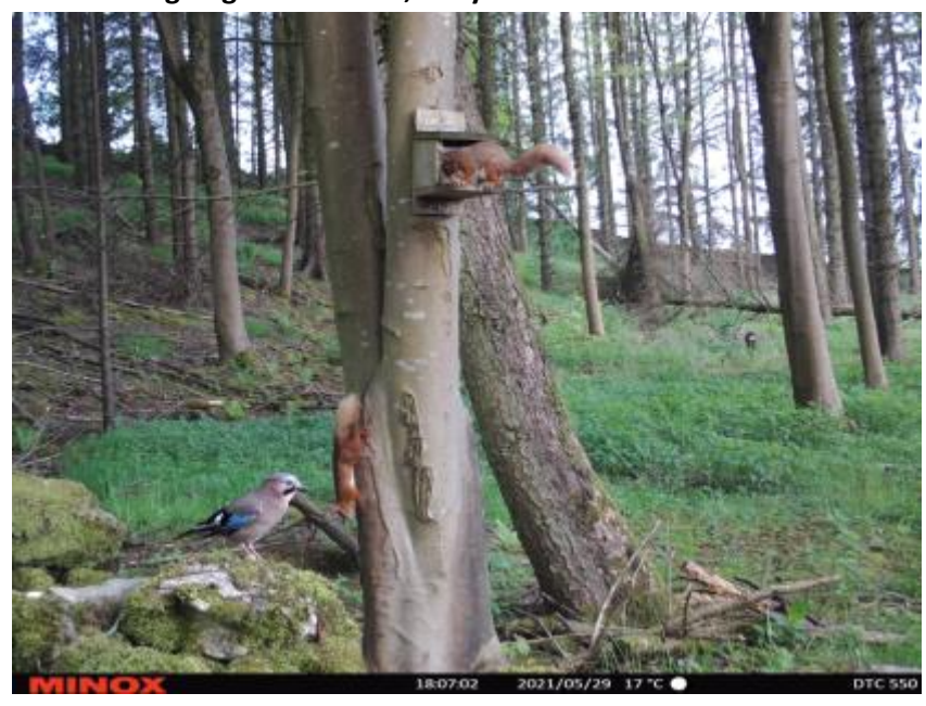
Who got the nut?