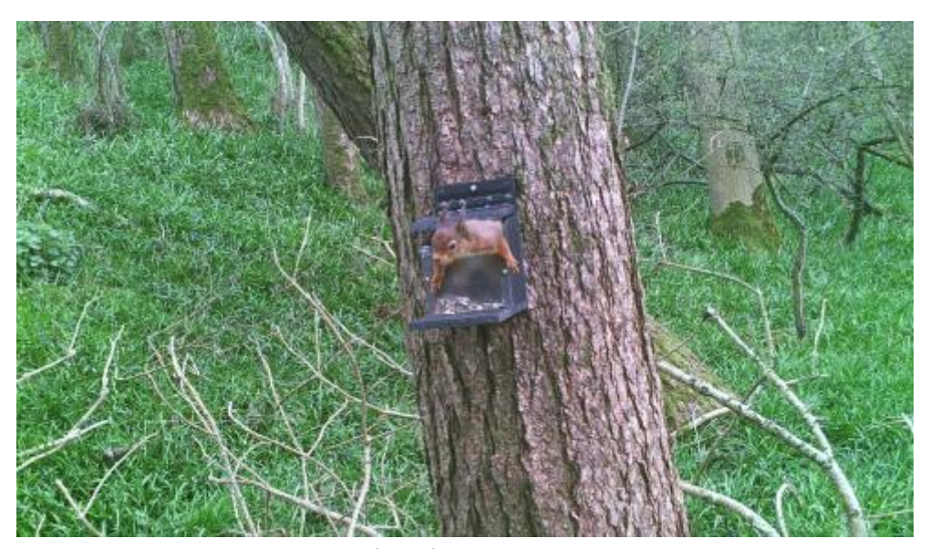
Still one of my favourite poses!

Feed still going within a day! Tends to be just two visitors, pale tail and one with a darker tail, looks fairly young Full marks if you work out the following caption: