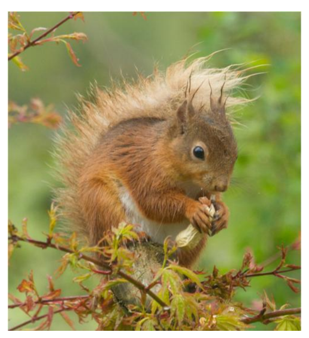
Well Head, Crosby Ravensworth