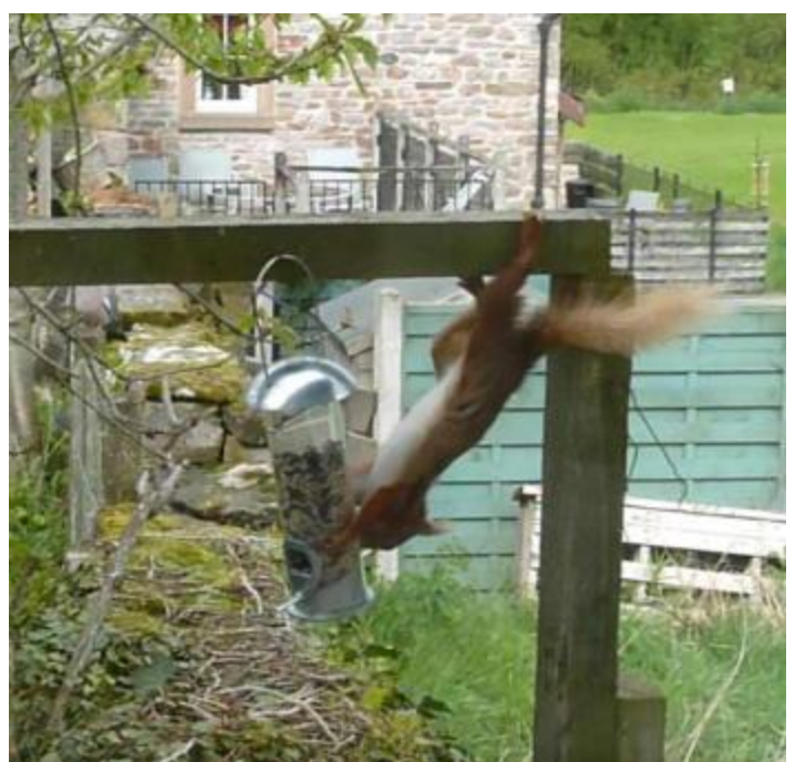
Left ... and soon tucking in from the conventional box,