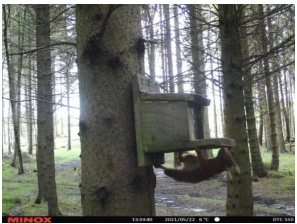
18<sup>th</sup> June – food still going regularly Camera re-sited here

But then this one below turned up which I think is a different red ... Just got to hang in there ...!