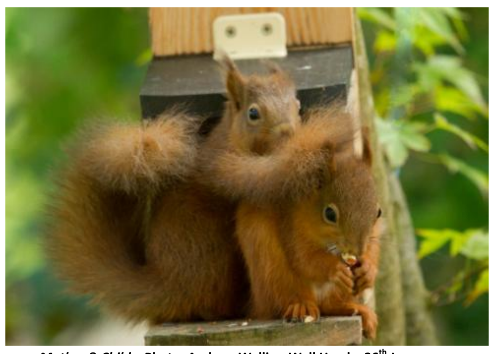
Mother & Child: – Well Head – 26<sup>th</sup> June