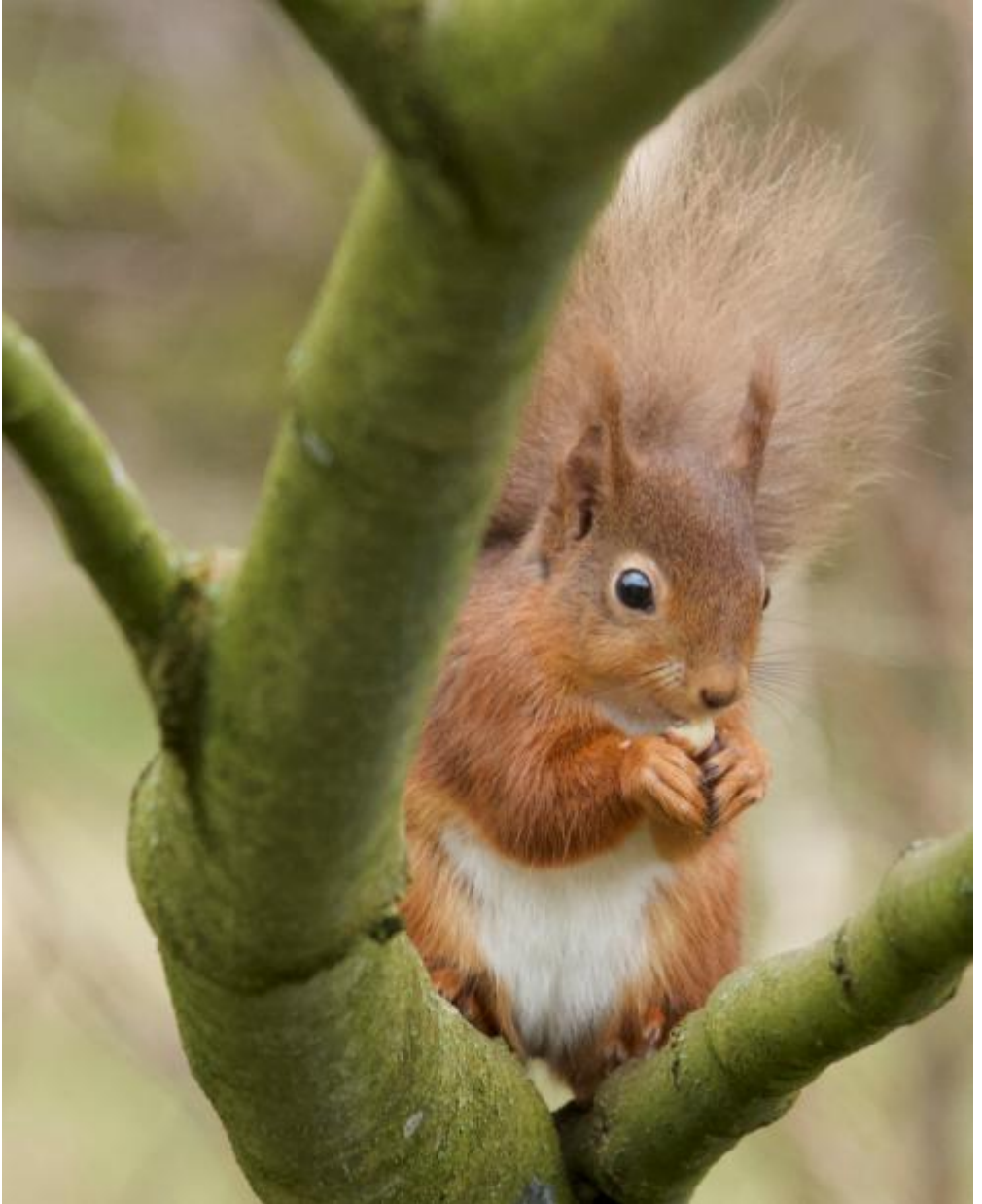
Well Head, Crosby Ravensworth