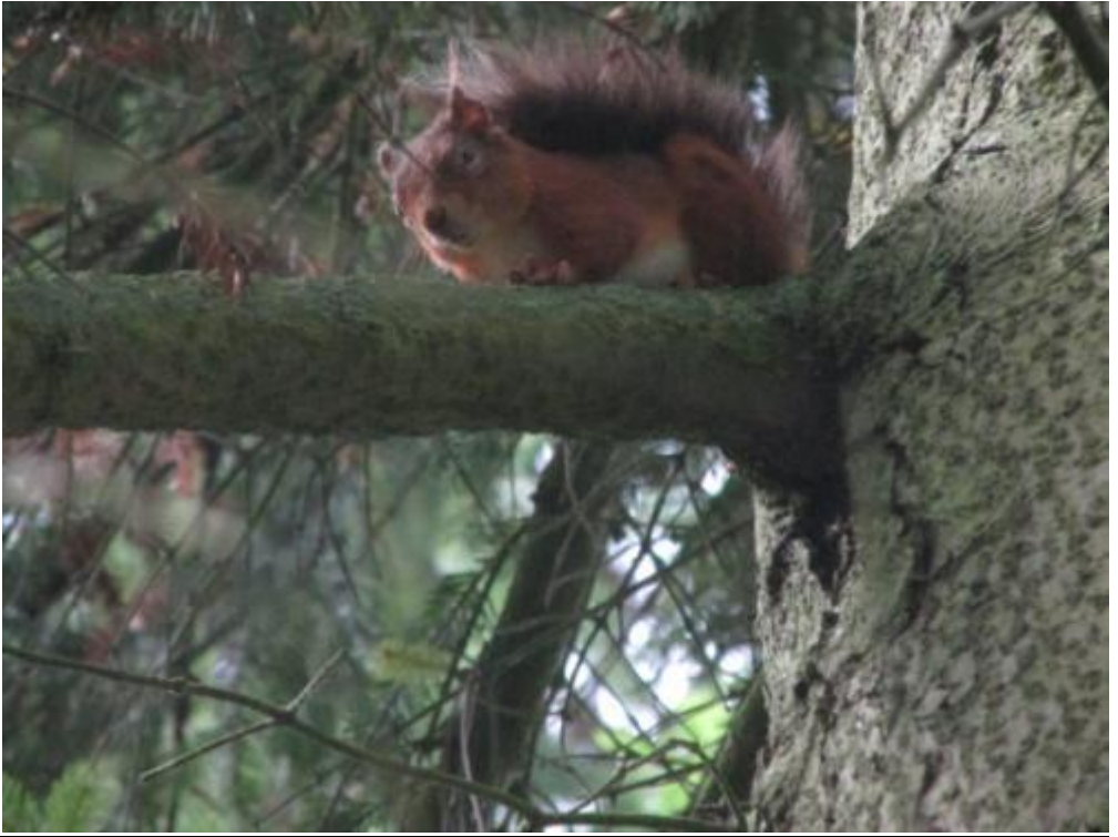
Flass Wood, Maulds Meaburn