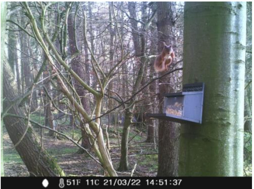
An action photo from a static camera