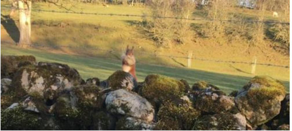
Nest Making (towards Oddendale)