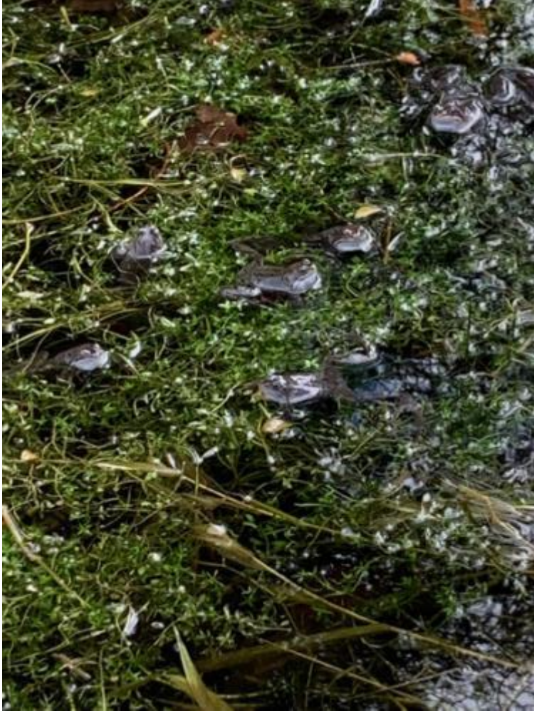
Frogs at Dunkirk, Reagill

A little selection of some ad-hoc photos that I have captured