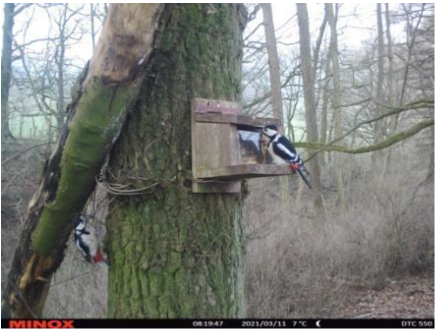
The new feeder at Longhill Wood – the woodpeckers really like it. But then so do the Jays!