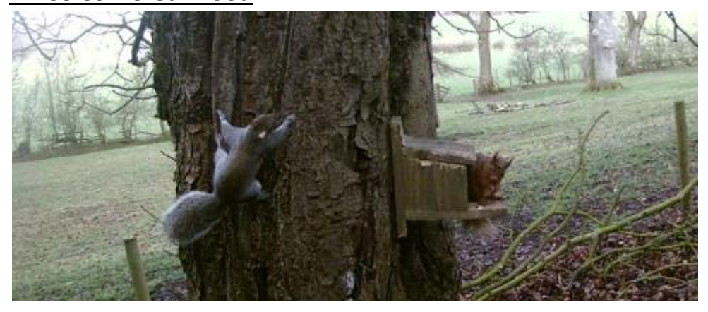
In many ways this photo sums up the position in this wood

However, due to the pheasant season the wood is out of bounds to us until the 1<sup>st</sup> February – 21<sup>st</sup> Nov , saw Callum who stated that he had seen x2 greys here!!!