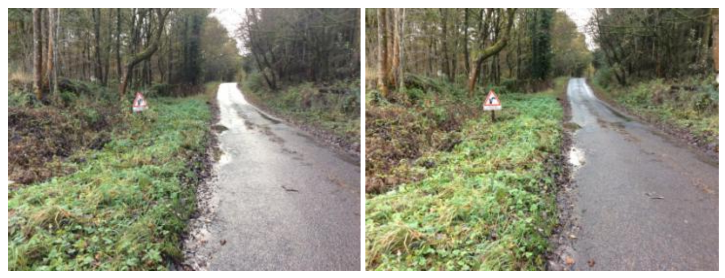
16 <sup>th</sup> – all still good. They feed well and regularly in both woods.