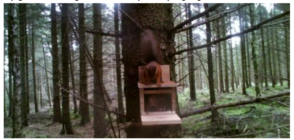
Wyegill Plantation – guess we could say ... 'are you going to let me out?'

5 <sup>th</sup> – what I like about this pair of reds in WP is that they eat everything. At present I'm finding that it is just monkey nuts that are been taken and nothing else, but here they are eating the seeds as well, still spending a lot of time sat inside the feeder.