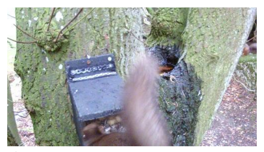
30 <sup>th</sup> – grey was back this afternoon

End of period – the grey continues to pop up at the PH