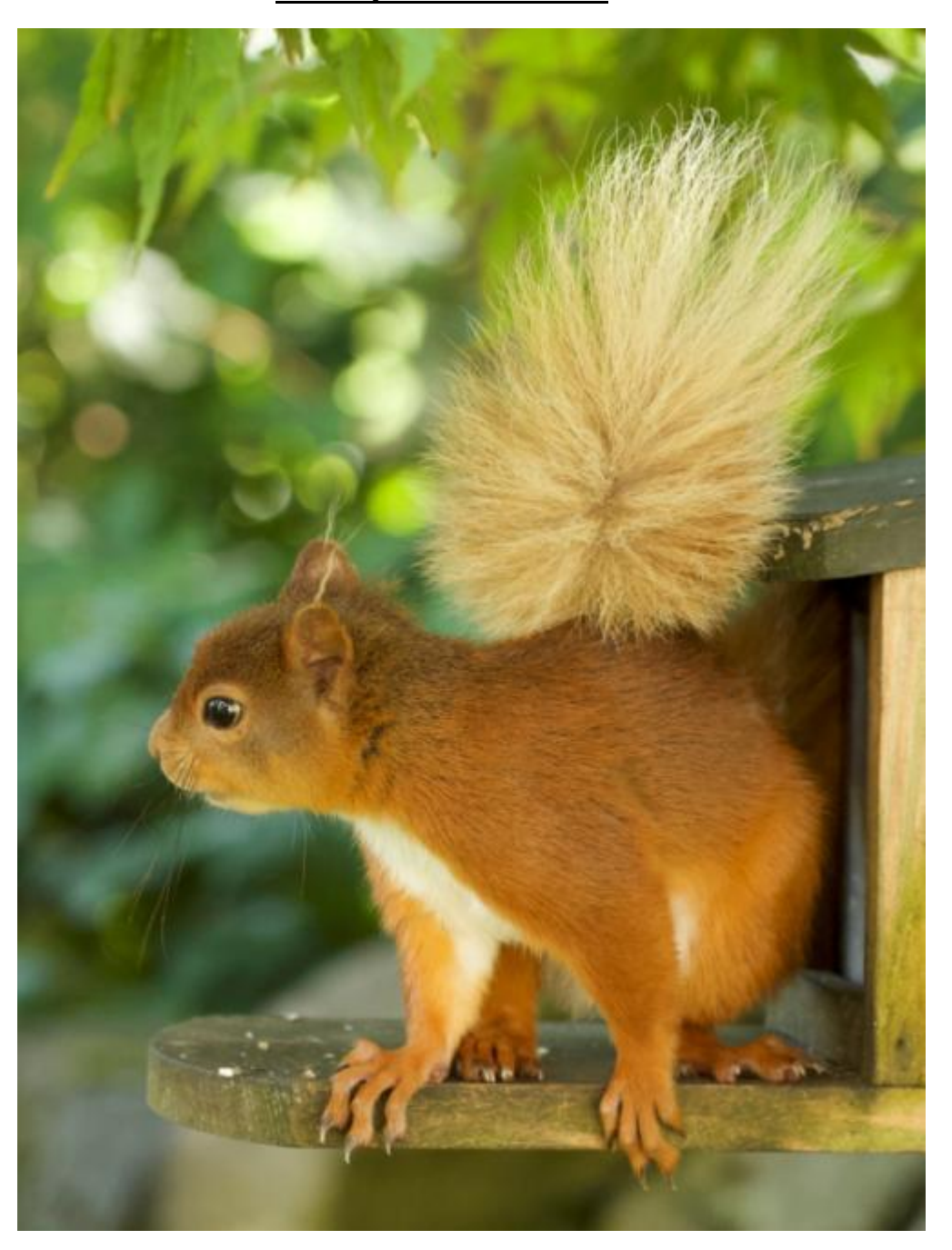
Well Head, Crosby Ravensworth