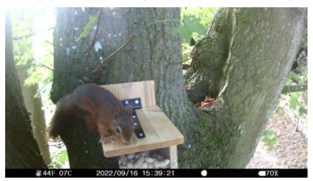
The new feeder at 'The Avenue'