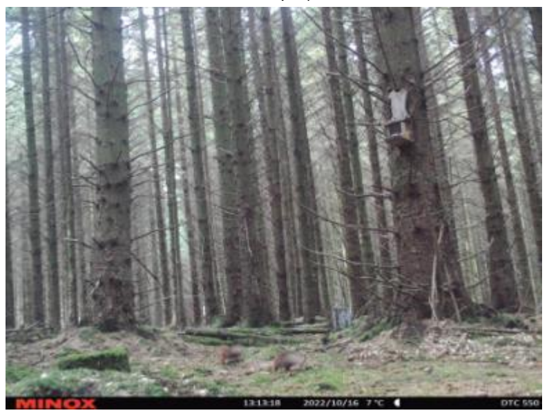
But there must be something ...!

Had tried a slightly different camera angle – the camera is at the base of a tree on which is the original feeder – I was somewhat curious as on the little 'lump' in the photo directly above the 'MINOX' there is always a large amount of spent shells from the squirrel feed and in the middle of that mossy lump is a large hole. What is in the hole or what it is used for/as, I know not.