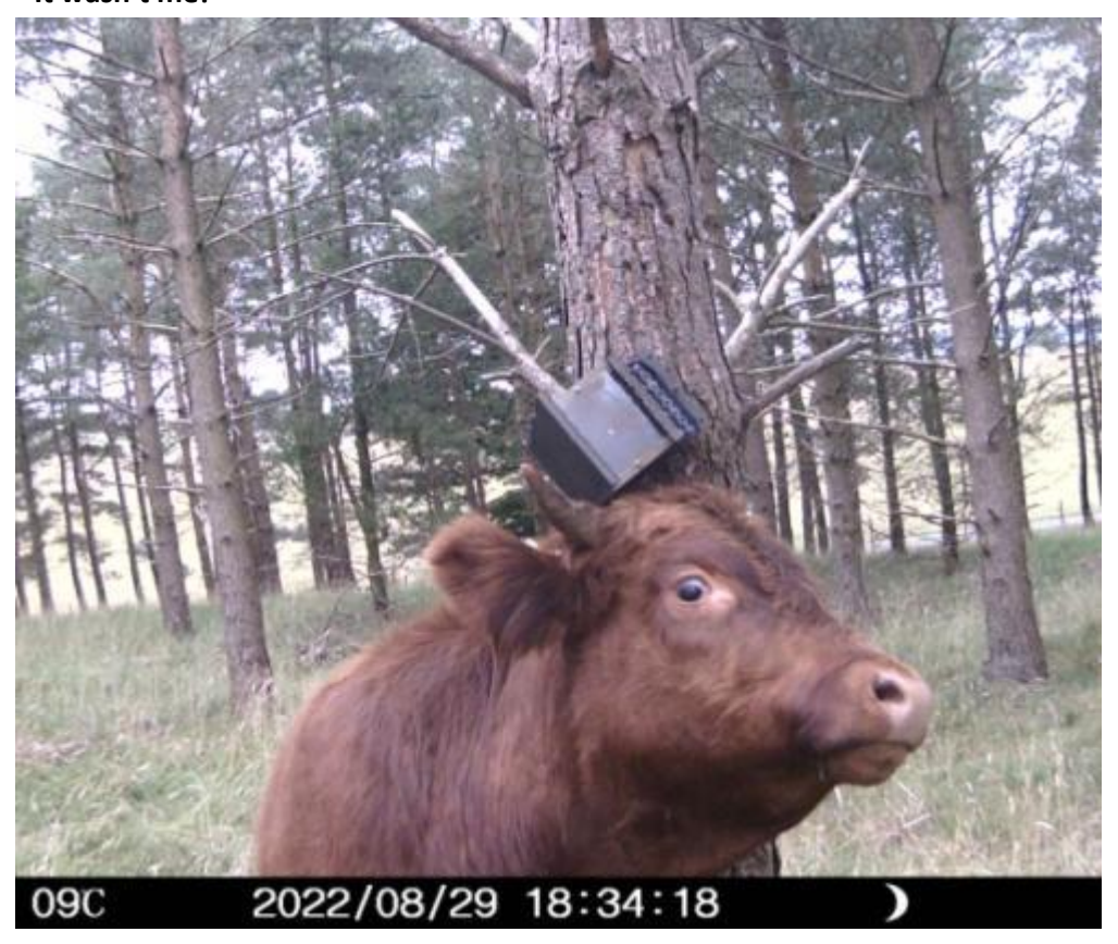
22<sup>nd</sup> - sorry I haven't been back in touch - it's been a very busy few weeks, but just to say, up to and including today, no greys appearing on the cameras, long may that continue! Liz