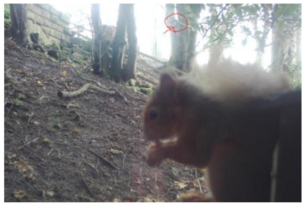
27<sup>th</sup> – the reason I like this photo is that there is another red on The Avenue feeder at the same time