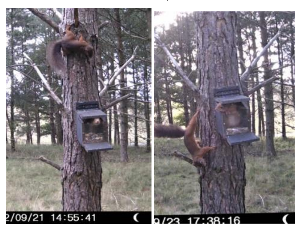
2<sup>nd</sup> Nov - saw 4 or possibly 5 reds in 2 beech trees up at Oddendale Plantation last Week -- Jane Woodstrover

26 <sup>th</sup> Sept - Hi Darren - The squirrels are as active as ever, no sign on the pics of any reds. Have attached a few recent photos! Liz