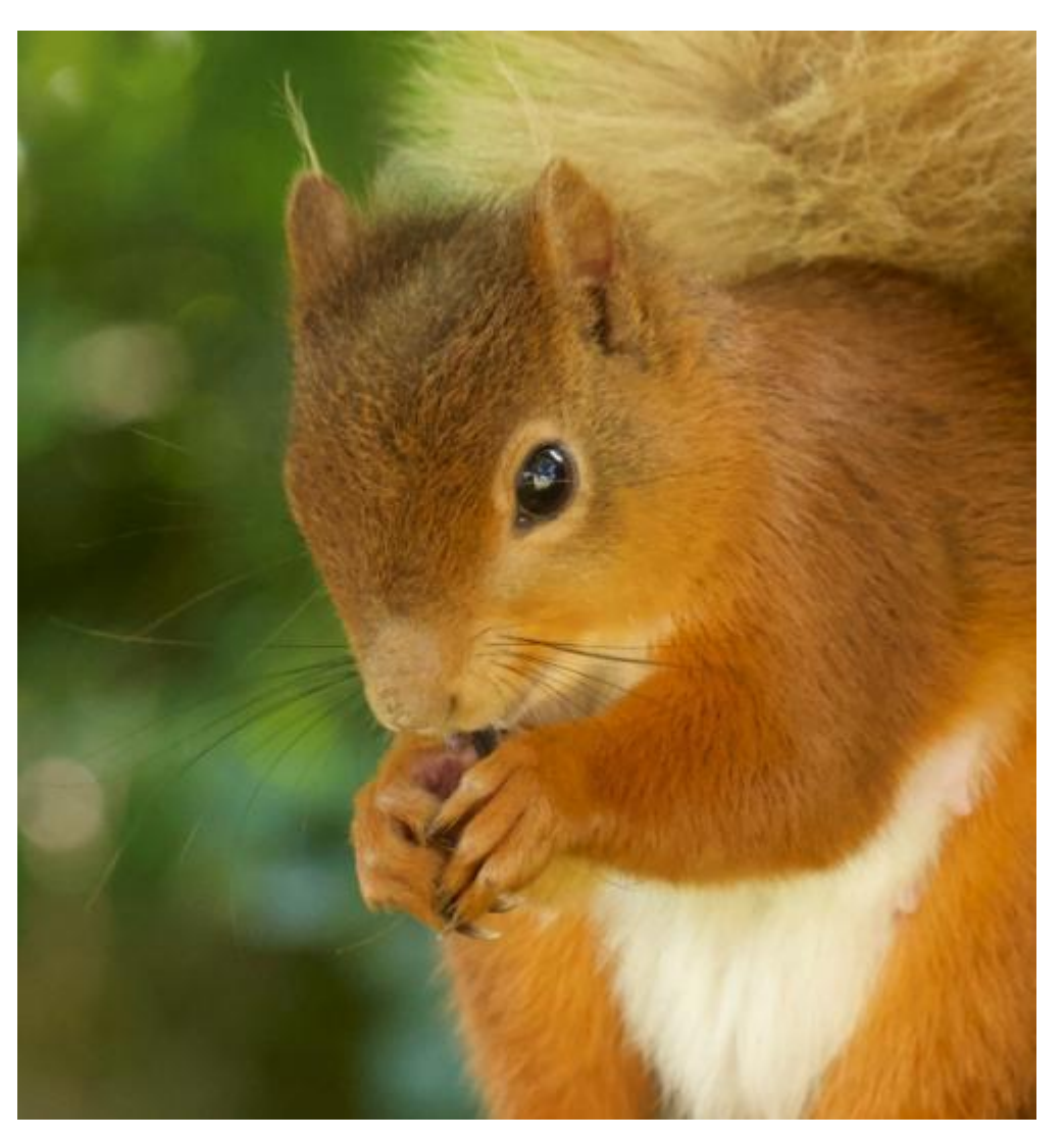
Well Head, Crosby Ravensworth