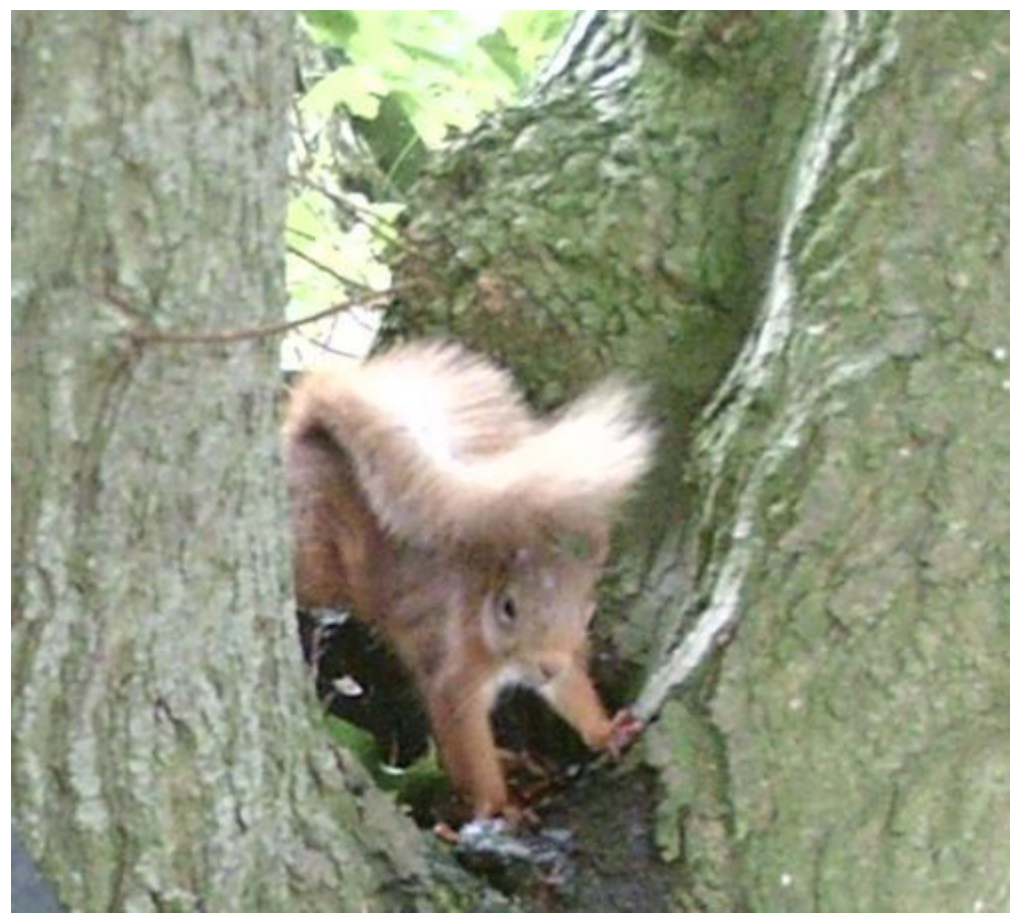
Flass, Maulds Meaburn

The story for the village is that I've not had too many reports of sightings, but in the area around Flass I am seeing plenty of reds, but there is a pesky grey(s?) that keeps making the occasional appearance