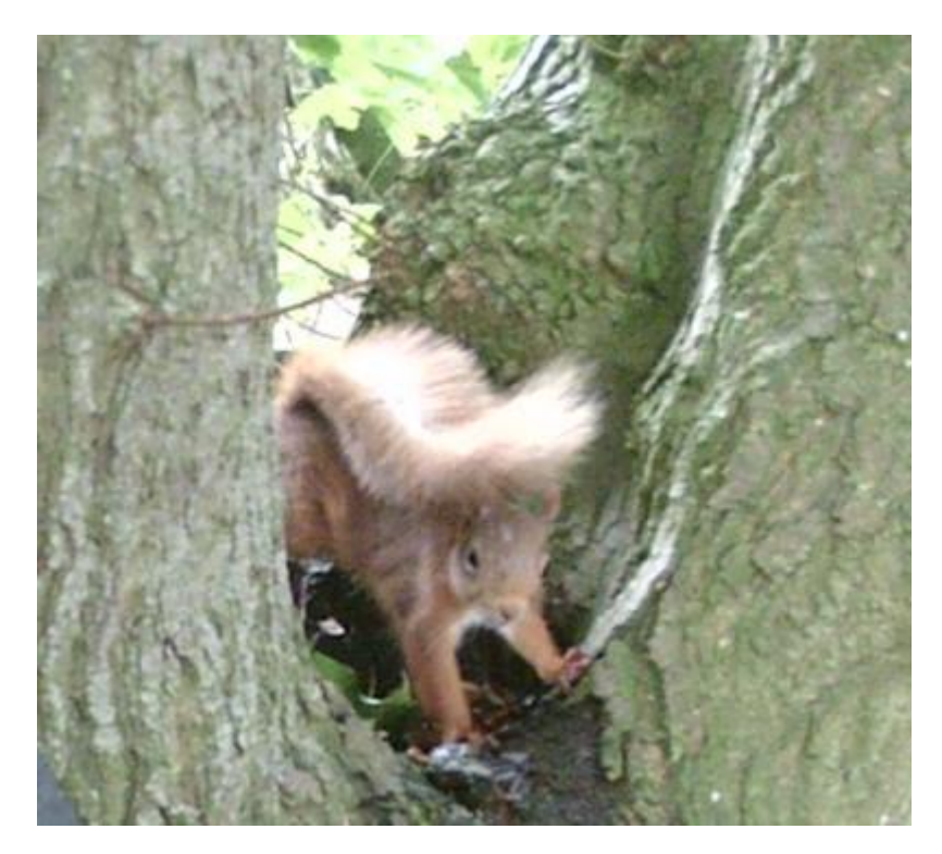
And up at the Folly ...