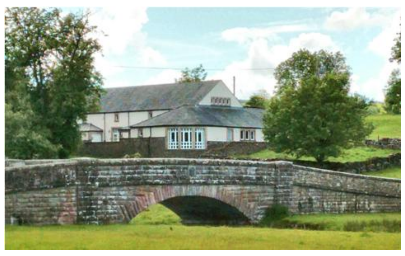
EXCITING NEWS from MAULDS MEABURN VILLAGE INSTITUTE